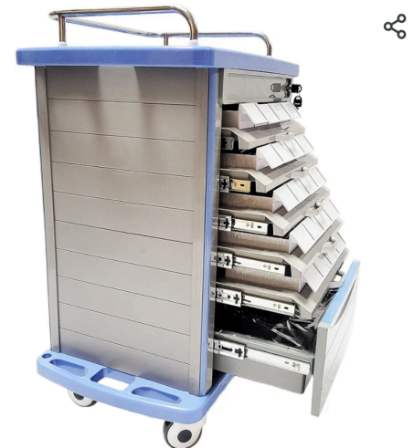
MS3C-200MBS Lite Compact Bin Cart, Expandable up to 160 Bins, Quick Ship